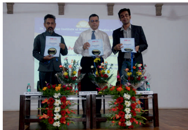
Release of the CD & ISBN Book

ACUMEN event was organized on 1st October 2016 at the institute. Members from Faculties, corporate and students of various B schools contributed to the event. 37 papers were contributed from the fields of Finance, Human Resource Management, Marketing, Operations and Agriculture. 12 presenters were invited to present their papers on the theme.