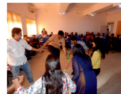
Alumni participating in fun-filled games arranged by the in-campus students