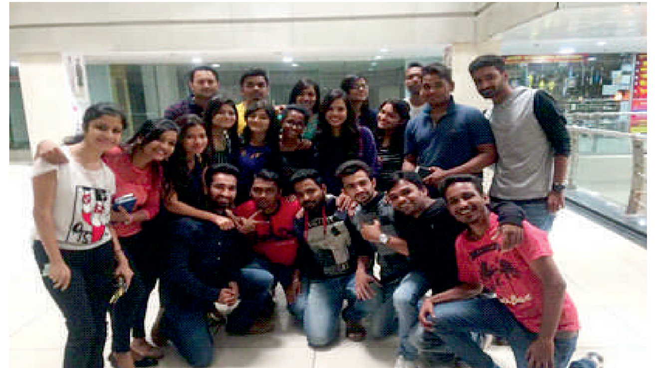
Students having fun while shopping for event at Empress Mall, Nagpur