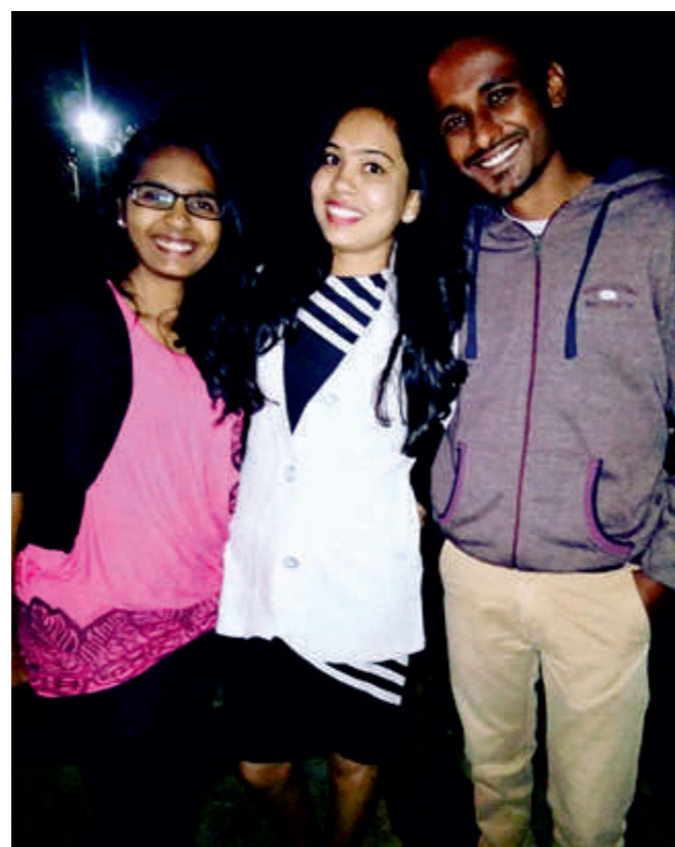
"True friends are like diamonds—bright, beautiful, and valuable and always in style."

Our students believe "The fastest way to change yourself is to hang out with people who are already the way you want to be"