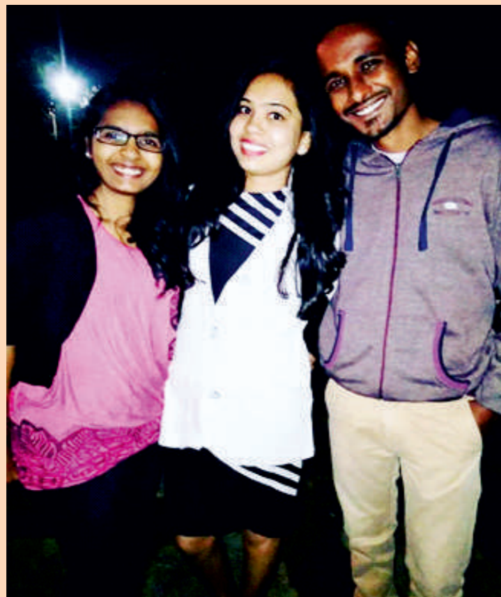
“True friends are like diamonds—bright, beautiful, and valuable and always in style.”