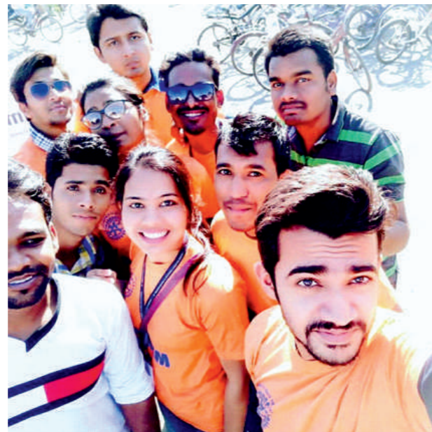
Students practicing for events

"The best preparation for tomorrow is doing your best today."