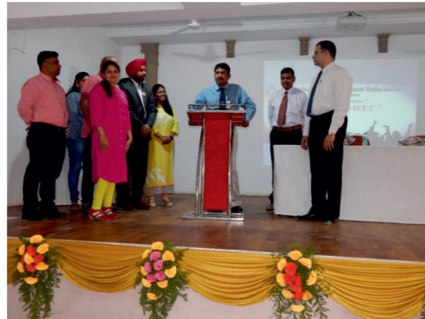
The Director addressing and congratulating the Alumni for their success

A conscious effort was made to help the alumni re-live their college life. The batches were categorised in four different groups based on the number of participants in each group and seniority of batches. We arranged a session where they introduced themselves to each other, where they could form associations for future development of their careers.