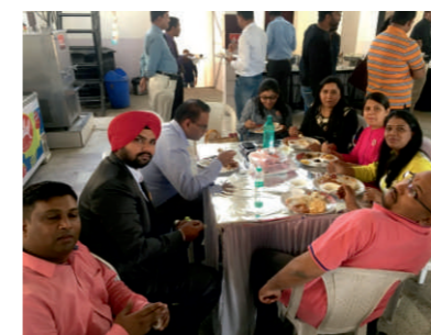
Alumni savouring the sumptuous lunch