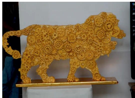
Happy moments of Anubhuti-2016