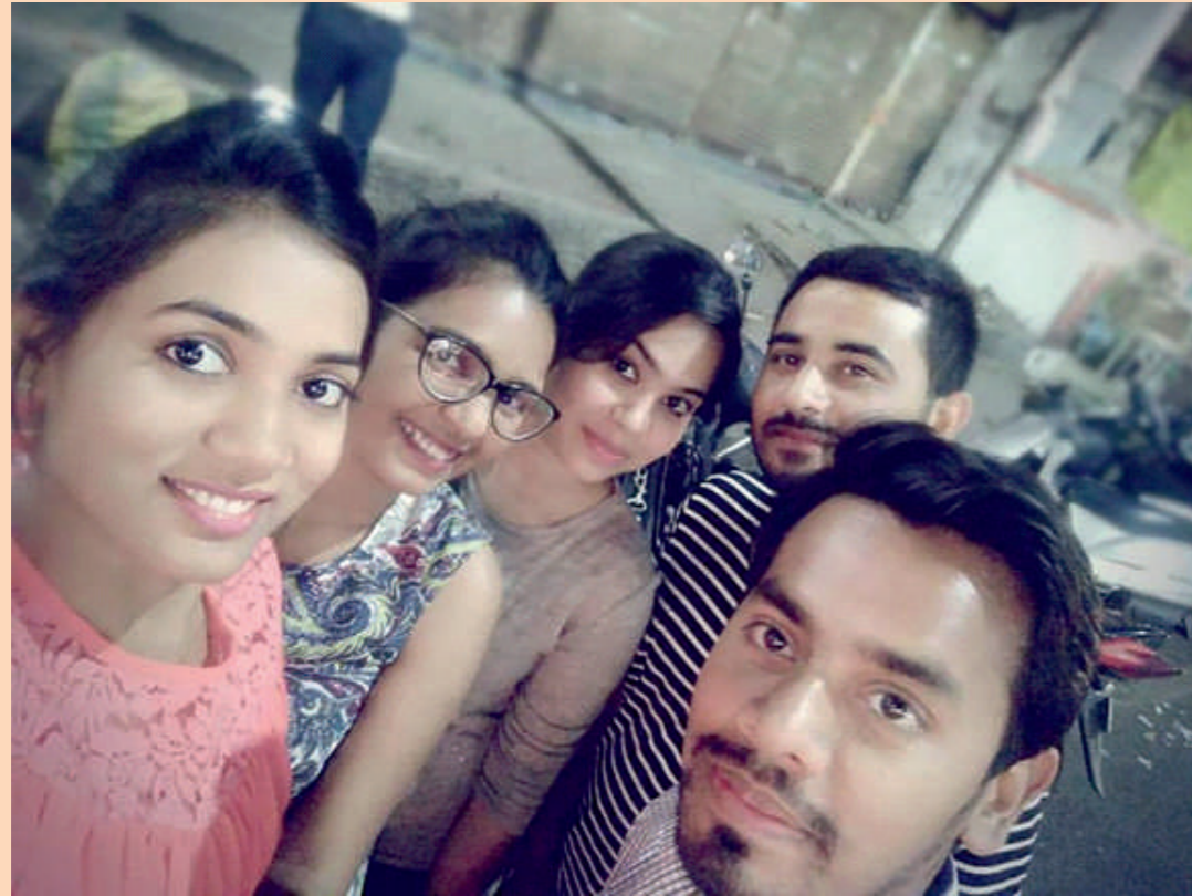
Students having fun outside the college after event