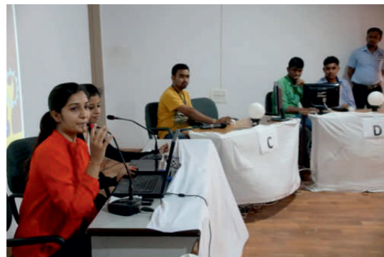
Practicing hard for ANUBHUTI-2016