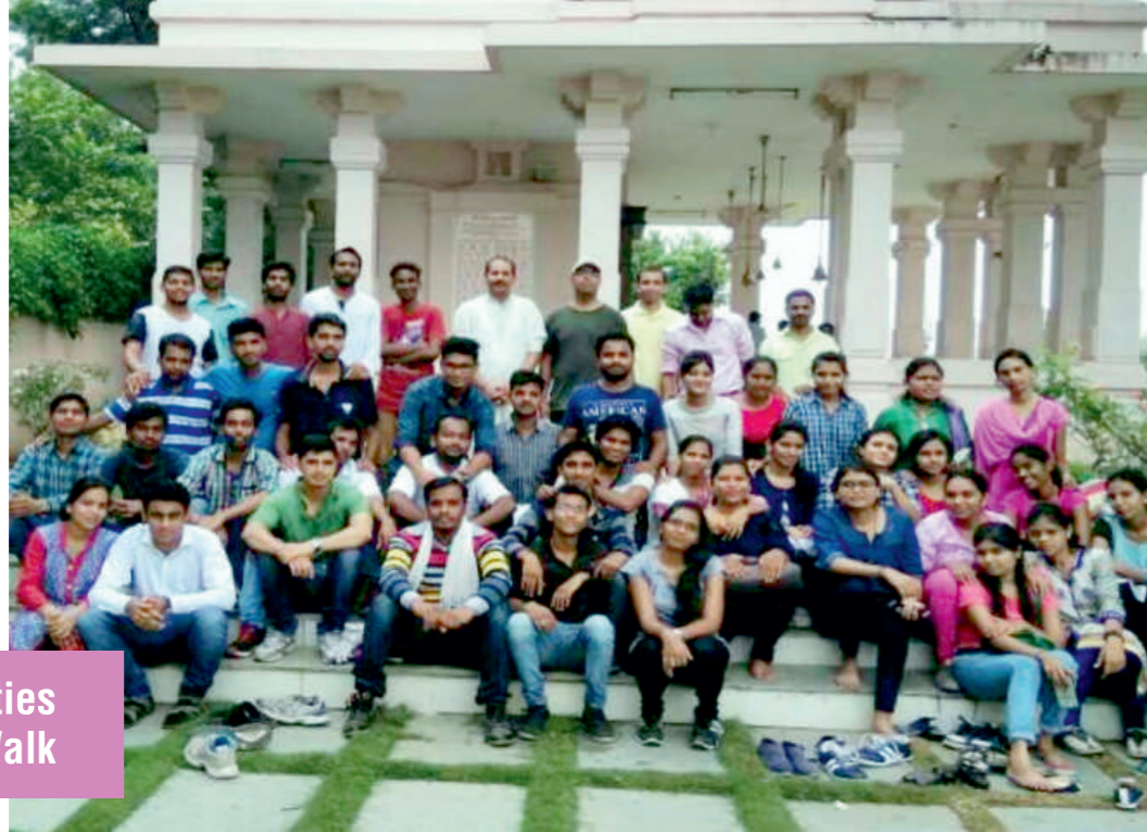
Students and Faculties Resting After a Long Walk