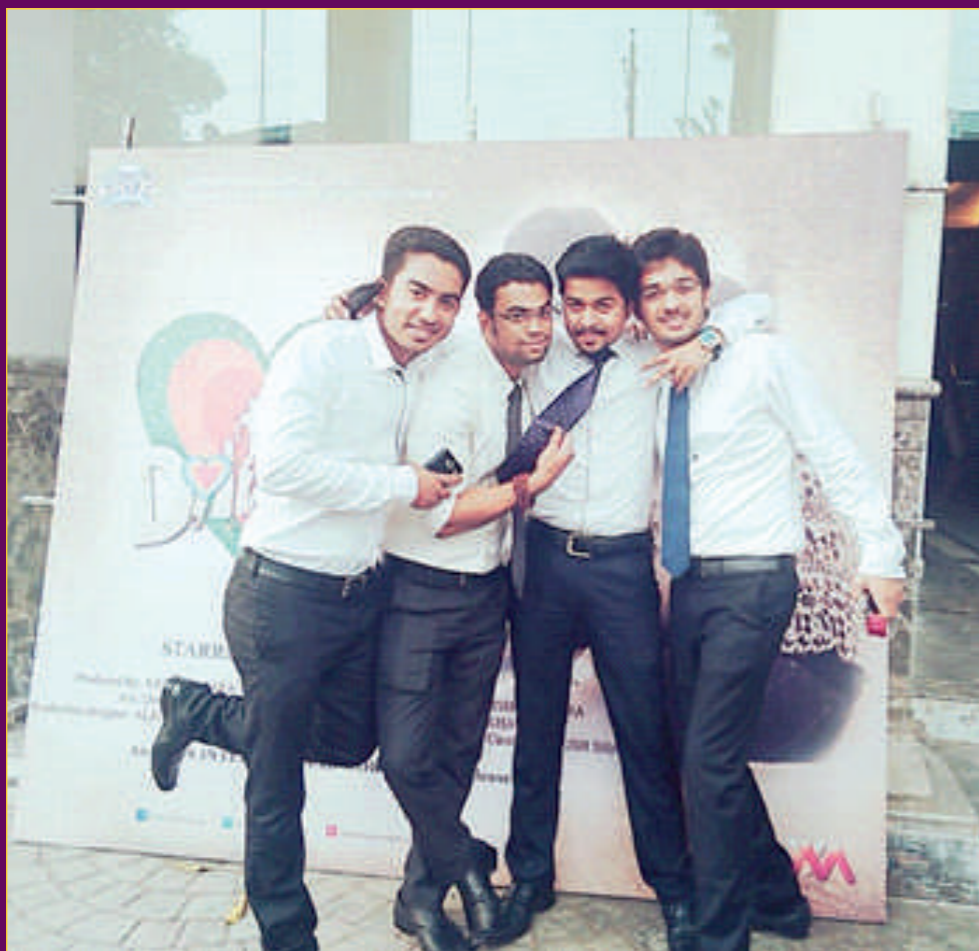
Creative creatures @DAIMSR