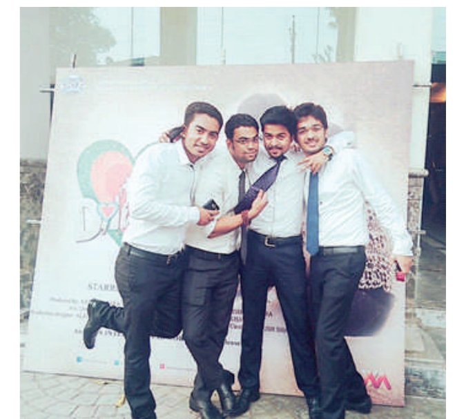
Creative creatures @DAIMSR

Cheering a friend before performance during event.. "A good mood is the key to success. That's why you should stay cheerful no matter what happens. Keep going and good luck!"