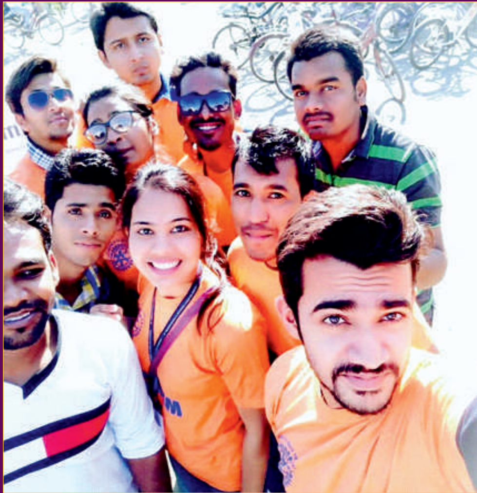
Students practicing for events