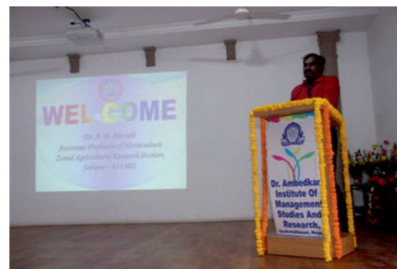
Presenters at the Event