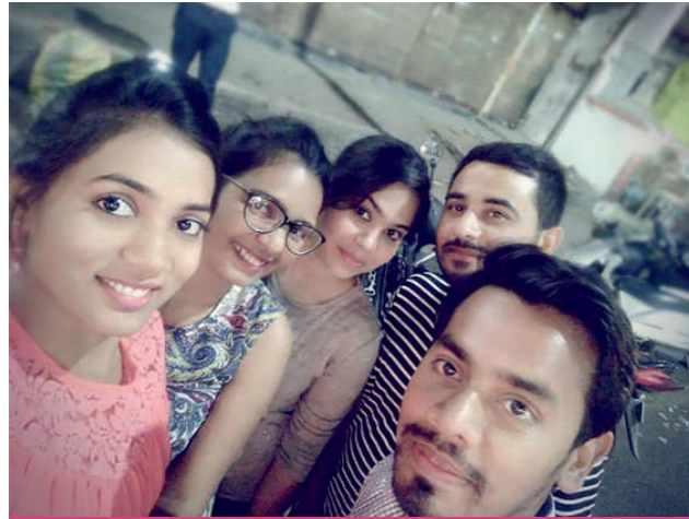
Students having fun outside the college after event

After every tiresome workout refreshment is must..... The aim and final end of all music should be none other than the glory of God and the refreshment of the soul.