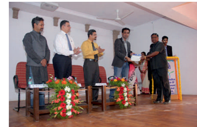
Certificate Distribution to the participant