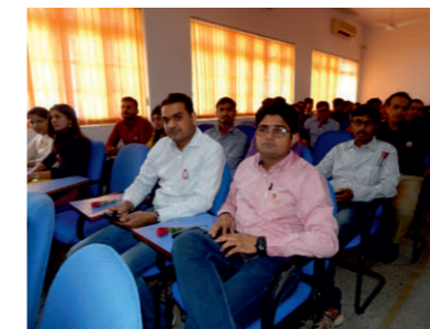
Alumni from different batches rendering a patient hearing