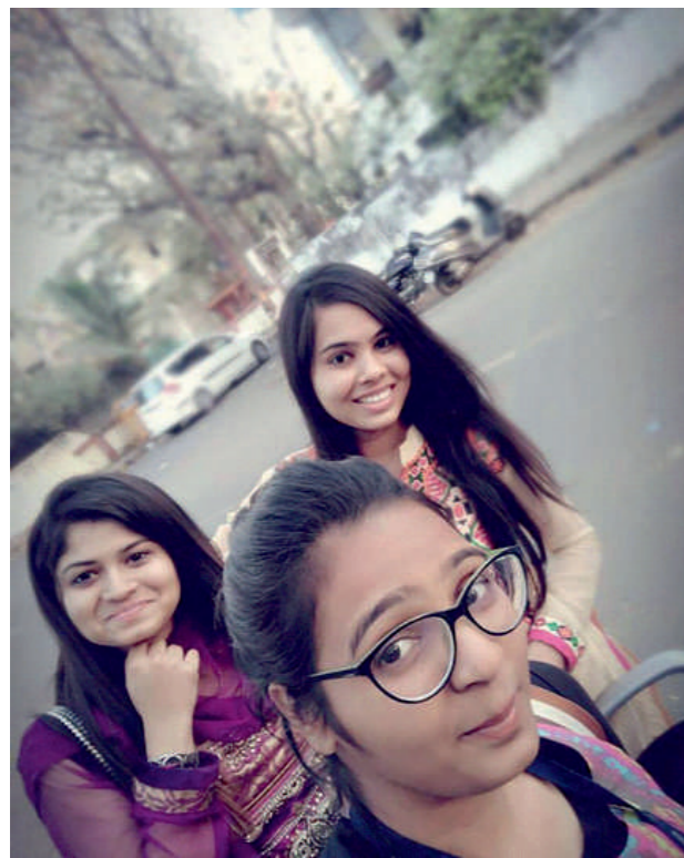
Friends for ever - having a roadside walk

"Lots of people want to ride with you in the limo, but what you want is someone who will take the bus with you when the limo breaks down."