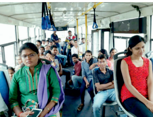
On the way back in the Star Bus

The 3 hour walk did not face any challenges or issues. The students participated and enjoyed the entire activity. Upon reaching the destination, once they had paid their respects at the Temple, the students had a gala time with refreshments and nourishing snacks. Once they had sufficiently rested, the students boarded the pre-arranged bus for a trip back to campus.